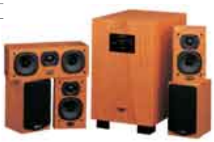
L2 Series Surround Package